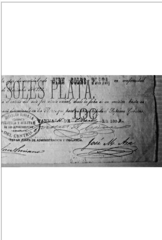
Image: Straight detail, bottom.